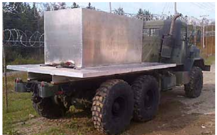
This tanker is a proto-type for Forestry—it's a 1,000 gallon water tank. Craig Smith has been working closely with Forestry developing a large capacity tanker for use in Maine's forests.